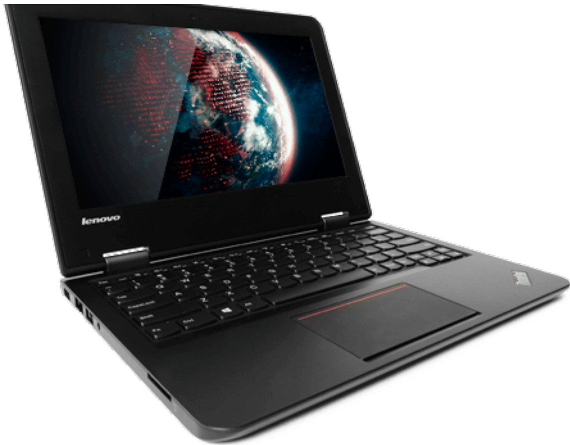
Lenovo 11e Model

An amazingly low powered box, and still not the lowest to be found today. It has the Intel N3150 processor and runs around 5 watts using Paratext/ Word Processing. The overall construction of these boxes seems stronger, at least in appearance, to the Dell and Asus models below, but they are heavier to carry. Approximate size of solar panel required: 30 watts (Calculated; not yet observed)